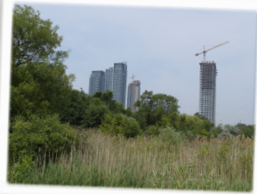
Urban in Mind Professional Urban Planning, Land Development & CPTED Consultants

Urban in Mind is a Boutique Urban Planning, Land Development and CPTED Consulting firm specializing Property Investigation, Land Development, Municipal Approvals, and CPTED Review/Audits.